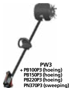
PW3 + PB100P3 (hoeing) + PB150P3 (hoeing) + PB220P3 (hoeing) + PN370P3 (sweeping)