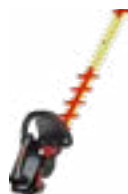
PW3 + THD700P3