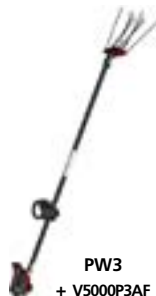
PW3 + V5000P3AF