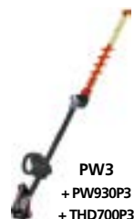
PW3 + PW930P3 + THD700P3