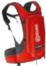
500Wh battery L810B