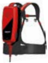
820Wh battery L850B