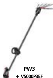
PW3 + V5000P3EF