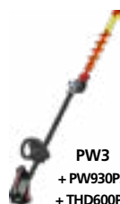
PW3 + PW930P3 + THD600P3