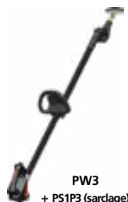
PW3 + PS1P3 (sardage)