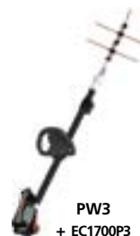
PW3 + EC1700P3