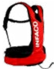
150Wh battery 731B

Cable compatibility PW225S (requires fuse replacement by 539F20).