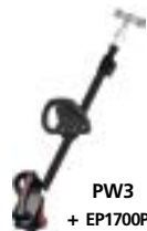
PW3 + EP1700P3