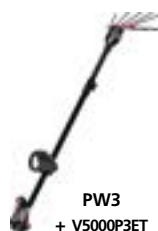
PW3 + V5000P3ET