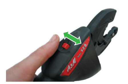
twist 3 turns

Ask your retailer to help you choose the best compromise to suit your region, the type of wire you are using and the tying method.